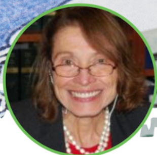
ANN ELMORE Office of the NC Secretary of State