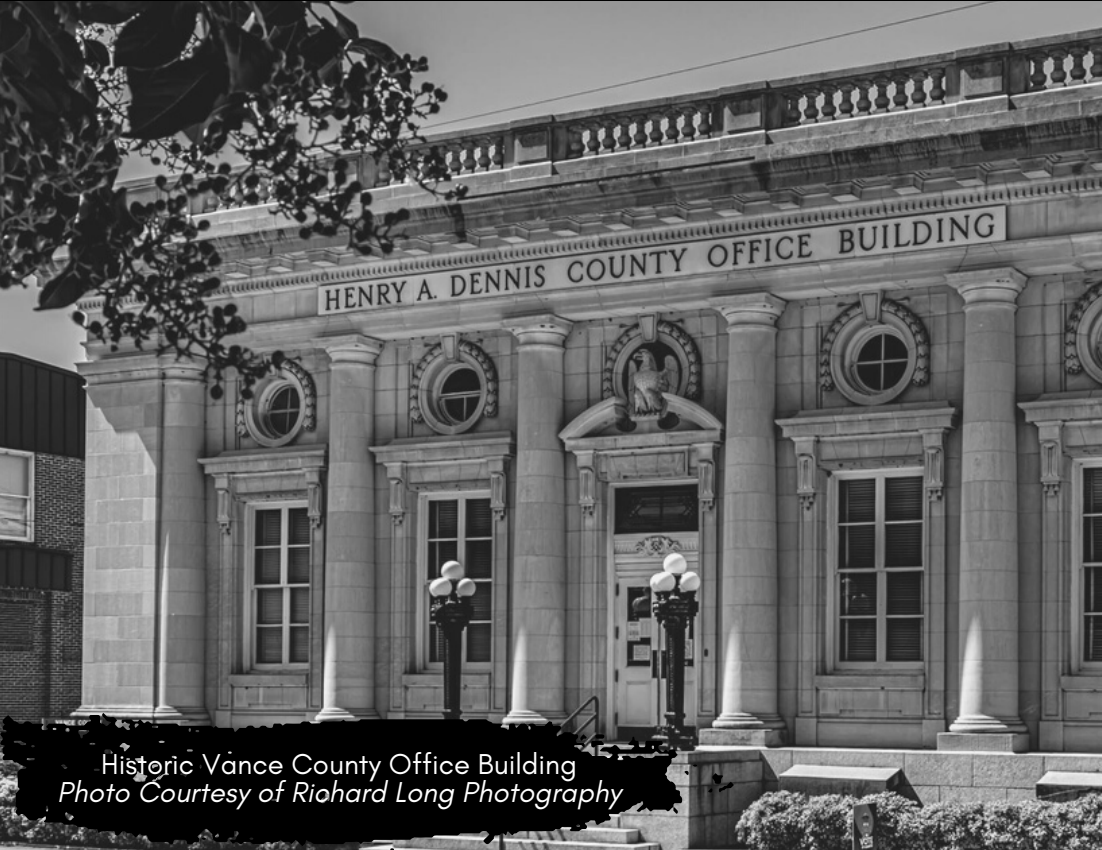
Historic Vance County Office Building