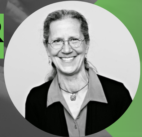
With Teepa Snow

Intensive Workshop: Best practices in dementia care