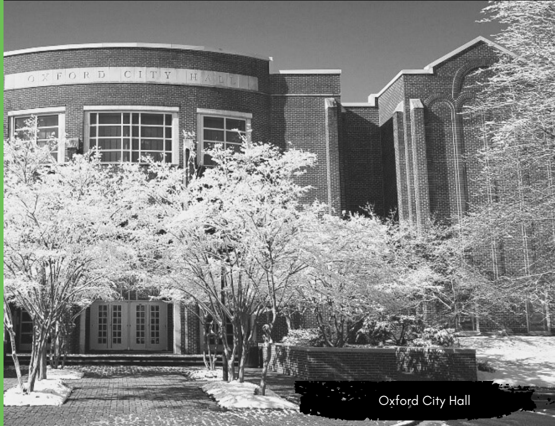
Oxford City Hall