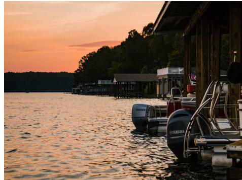
Kerr Lake, Henderson NC

Initiated in 2014 as a collaborative effort between member governments and the Kerr-Tar Rural Planning Organization (KTRPO), “NC Lakes District” serves as both a transportation planning tool, and regional tourism initiative. Consistently identified in feedback collected for the most recent Comprehensive Economic Development Strategy, updated in 2022, was the region’s strength of recreational opportunity. Two of the ways this opportunity was incorporated into the 2023-2027 CEDS include enhancement of recreational assets and convening regional tourism directors. Although the reach of recreational opportunity exceeds those two objectives, the NC Lakes District project will allow for Community and Economic Development staff to continue the conversation around recreational opportunity in the Kerr-Tar Region.