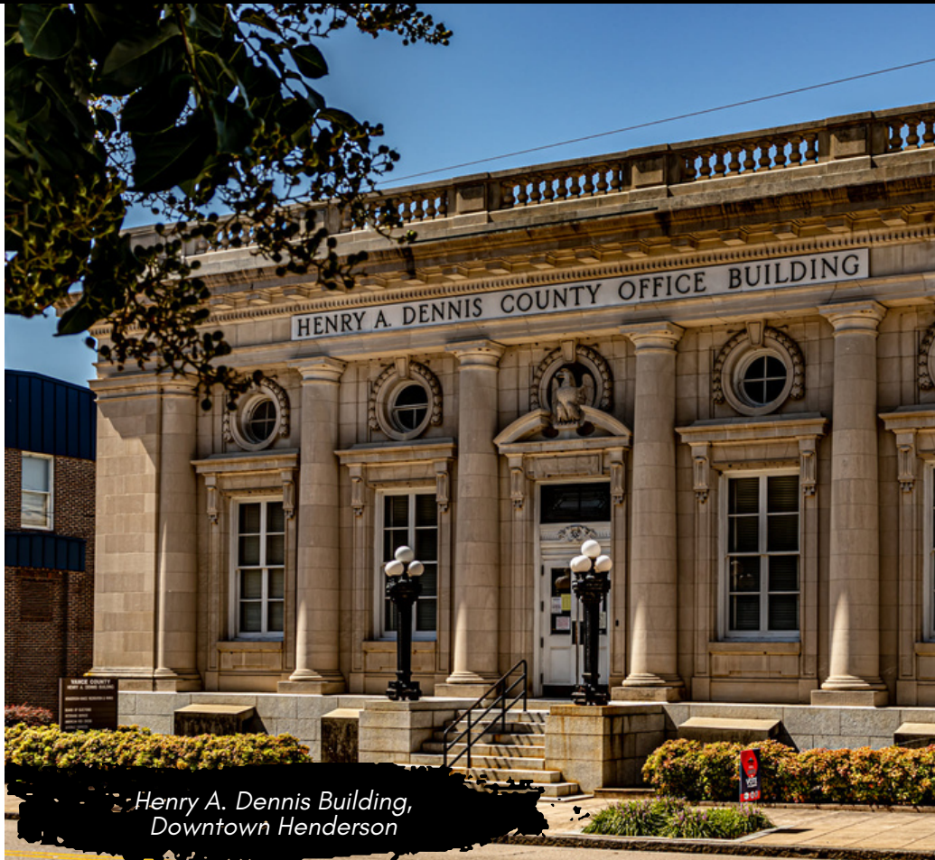
Henry A. Dennis Building, Downtown Henderson