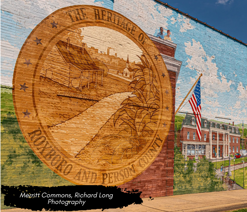
Merritt Commons