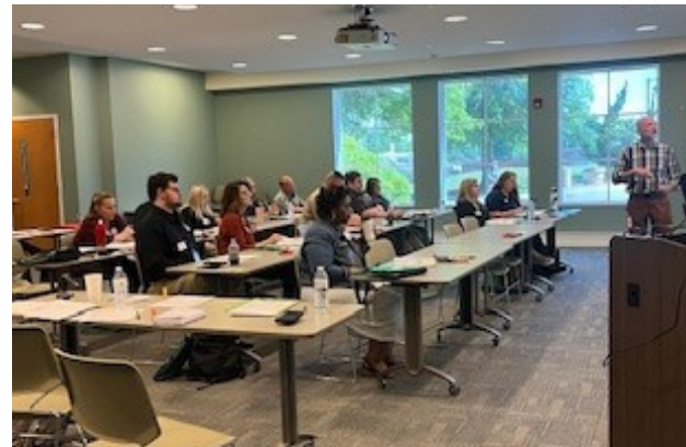
Henderson Training Session

Attendees left more aware of the FEMA/NCEM Public Assistance (PA) Program, the tools, resources, contacts they can call upon for support, and best practices to prepare for disasters. The April 18 training was held at the Perry Memorial Library in Henderson and provided the same opportunities for the 19 participants that attended.