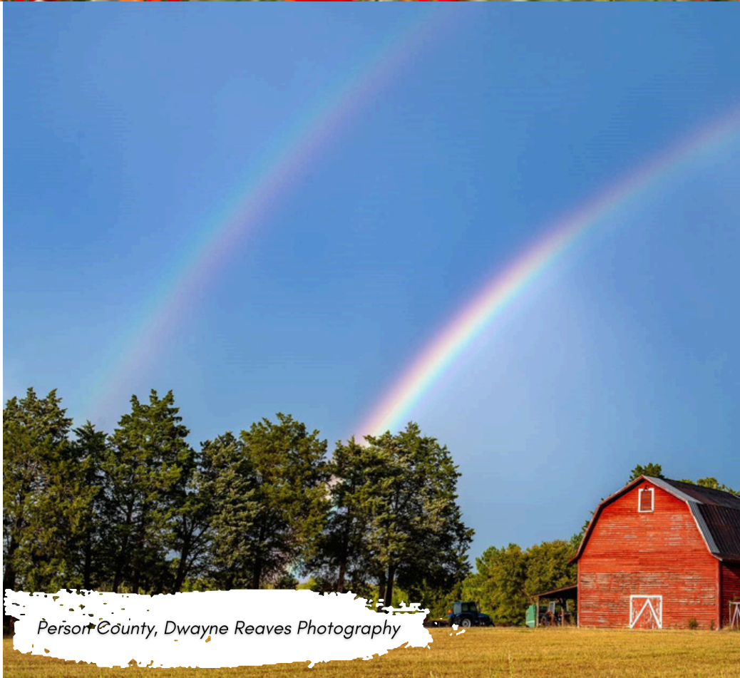
Person County