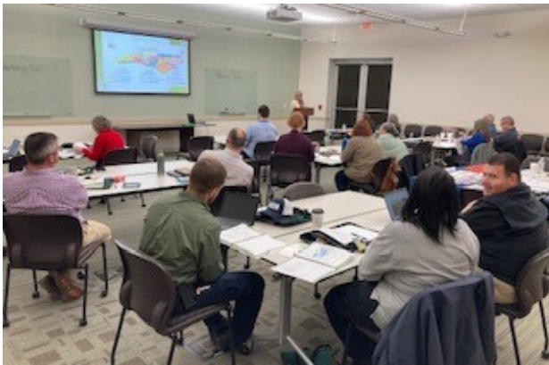
Butner Training Session

Member governments across the Kerr-Tar region were invited to a training focused on financial administration of public assistance funds for disaster recovery. Two training date opportunities were available, Thursday, April 11 and Thursday, April 18 . The April 11 Training was hosted at the Town of Butner by the COG and was part of a project funded by the North Carolina Emergency Management Association and the NC Association of COG's. The 21 attendees gained knowledge and tools to build and maintain the necessary financial systems and identify the staff support needed to administer and report on the utilization of disaster recovery funds.